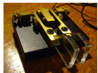
Vibroplex Code Warrior with black base, brass movements, clear paddle grips, perfect for portable operation as it's small and easily transported. Price:$65 (new $119) Great for the new cw op or experienced user)

For Sale by Larry, W1AST – w1dby@gmail.com , (413) 348-3289 (9 am to 9 pm)