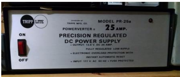
TrippLite 25A regulated Power Supply. Works great. $75.00

TS-120, SP-120, VFO-120, PS-30, AT-120, MC-50, (2) MC35S all is good condition TS-120 works great on 80,40, and 20. On 10 & 15 its like its in AM mode with a 100watt carrier. Don't know what's up with that. Not enough know-how at this end. $320.00 for the entire line. Nothing will be sold separately.