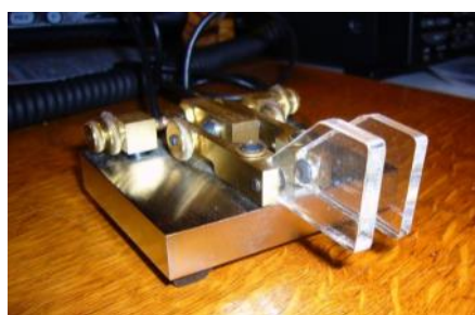
Vibroplex Code Warrior with chrome base, Chrome movements, clear paddle grips, perfect for portable operation as it's small and easily transported. Price: $95 (new $149)(great for the new cw op or experienced user)