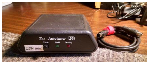
LDG-817 antenna tuner for FT-817 and other QRP types. Comes with manual at CAT cable. $75.00

To purchase any of these items please email Harold Woering: n1ftp@arrl.net