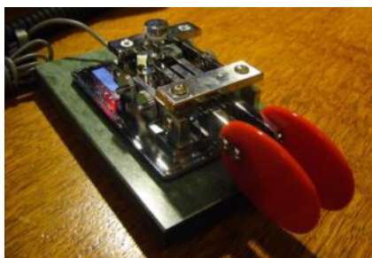
GHD 307WS paddles. Chrome with red finger grips mounted on a marble base. Beautiful to look at and operate. Price: $100 (New $229)

To purchase any of these items please email Harold Woering: n1ftp@arrl.net