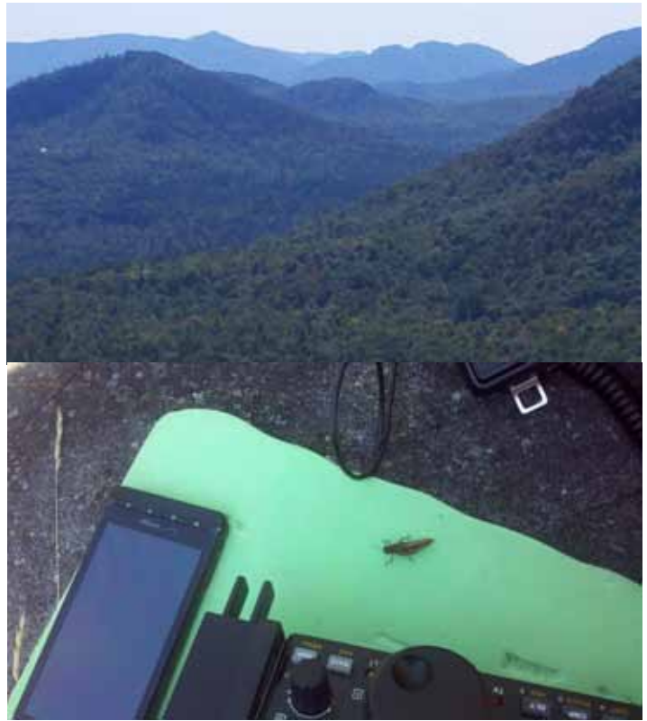
A view in the Adirondacks and a paddle AND a bug?

4th Monday of February, May, August, November 7:00 PM, FCARC VE Exams, Unitarian Church, Main Street, Northfield